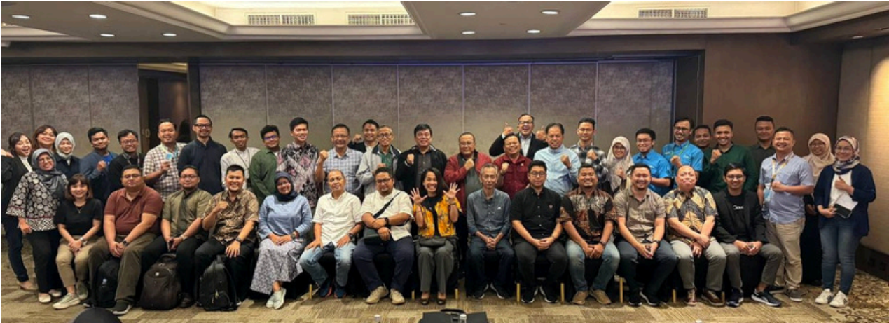
CEO Meeting: PANDI held a meeting with all registrar partners at Ayana Mid Plaza (January 18, 2024).