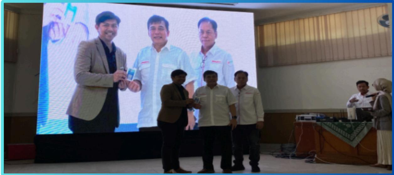
Inauguration of the 1 Teacher 1 ID Program: The President of PANDI (center) symbolically handed over TapTap cards to teachers, (March 7, 2024).