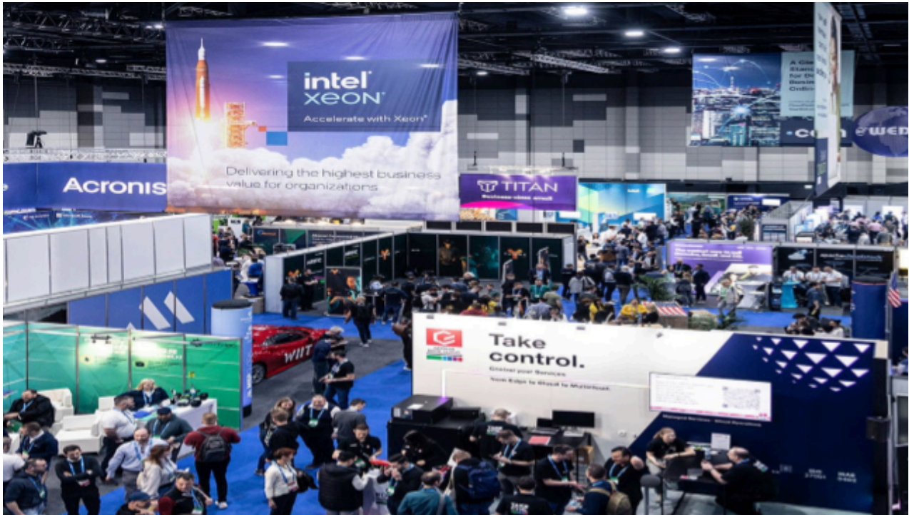
CloudFest 2024: PANDI attended the CloudFest 2024 event in Germany.