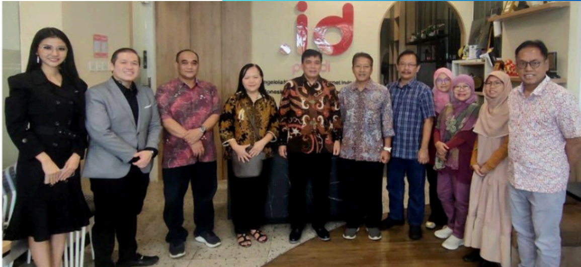
Panelists Meeting: Building synergy among panelists in developing PPND resolution policies (April 19, 2024).