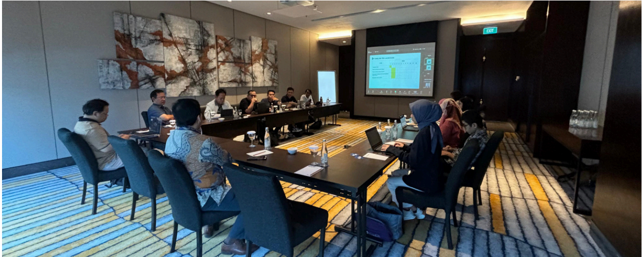
Board of Directors Meeting: PANDI held a Domain Name Policy Development meeting in Bandung (June 28, 2024).