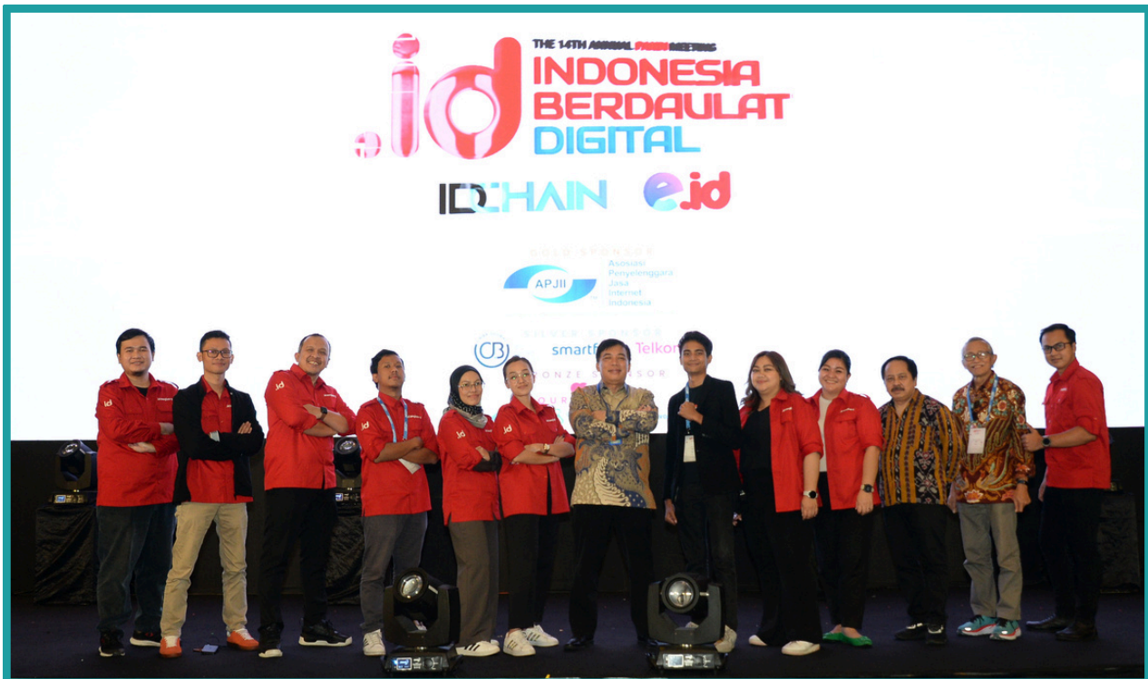
Indonesia Berdaulat Digital: PANDI launched IDCHAIN and e.id (May 16, 2024).