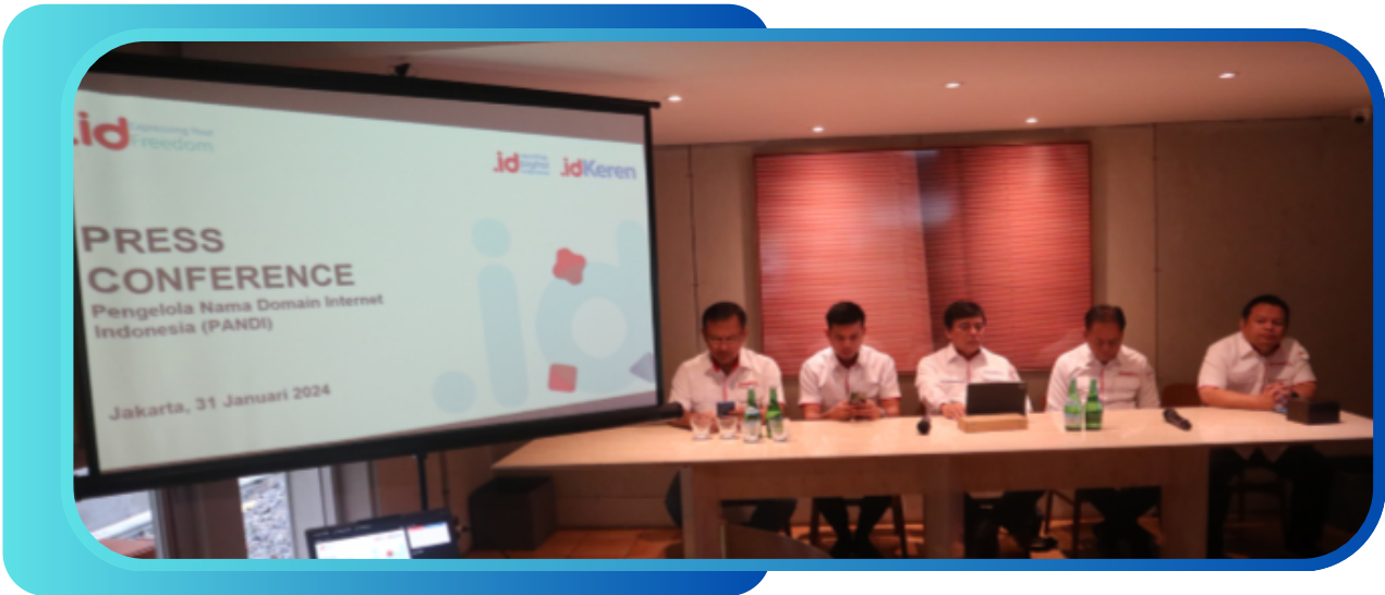
Press Conference: PANDI's Board of Directors presented the performance report for PANDI in 2023 (January 31, 2024).