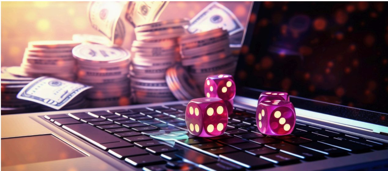
Illustration of online gambling