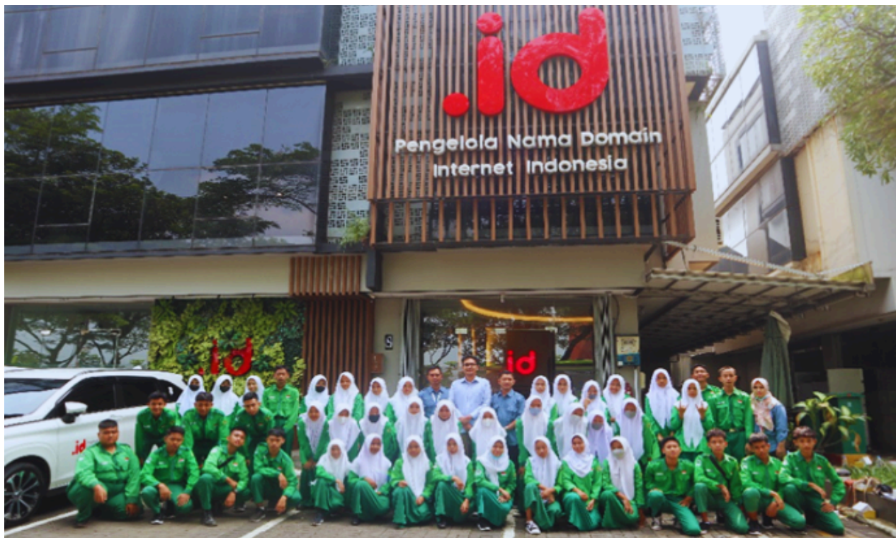
Socialization: Students from vocational high schools visited the PANDI Office to gain literacy related to digitalization.